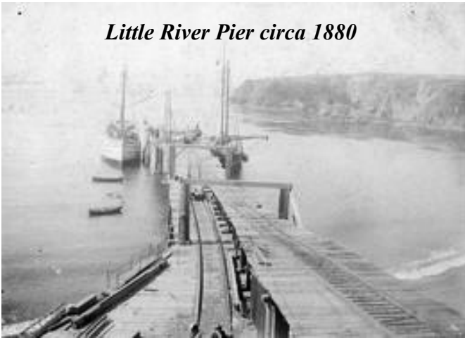
Little River Pier circa 1880

Wharf they built extended from the cliff on the north side out 330 feet into the sea, and was one of the few wharves in the area. During its use it was well-maintained, lasting nearly 40 years into the new century. It provided economic benefit to the mill as well as the town as it brought passengers, goods, and freight in and out of the sheltered port. Depicted at left, it had two levels with rail tramways, the upper one for loading and unloading ties and freight, the lower one for lumber directly from the mill, which was located in what is now the entrance area to Van Damme State Park. The port is long gone, but buried beneath the sands of time are the remnants.