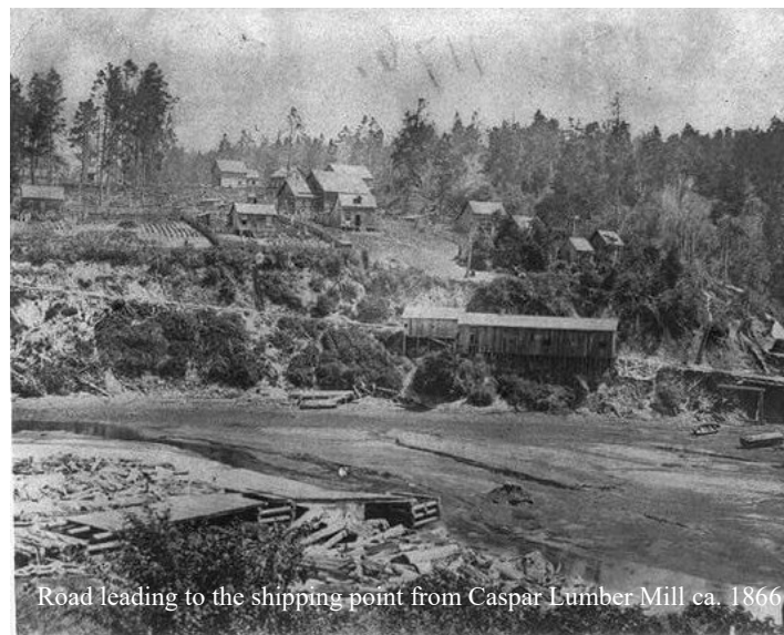
Road leading to the shipping point from Caspar Lumber Mill ca. 1866